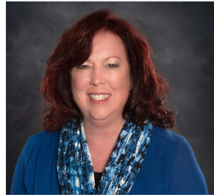
Mayor Tammy Dana-Bashian